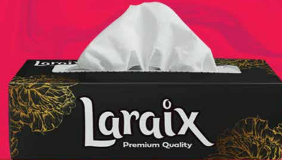
Black Premium Tissues 200x2 PLY