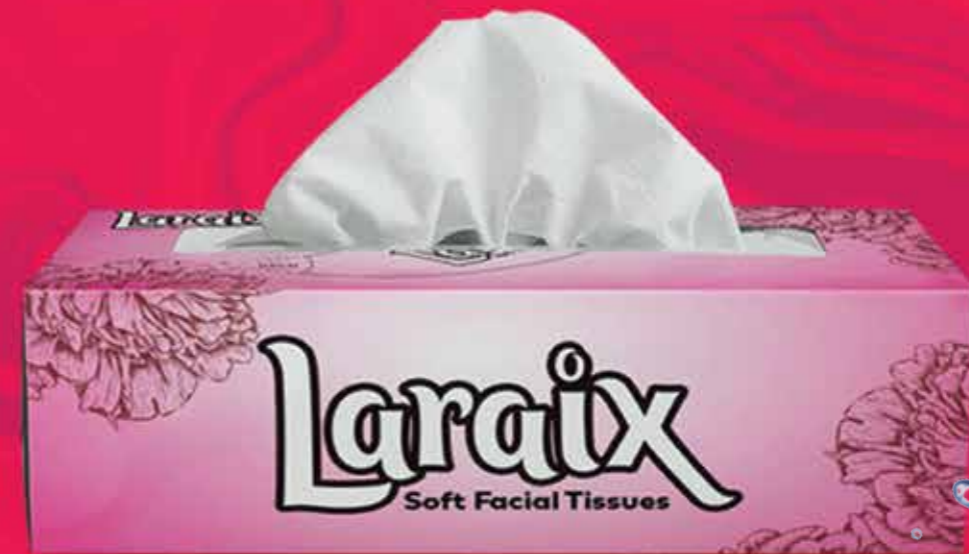
Pink Soft Facial Tissues 150x2 PLY