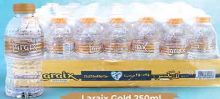
Laraix Gold 250ml