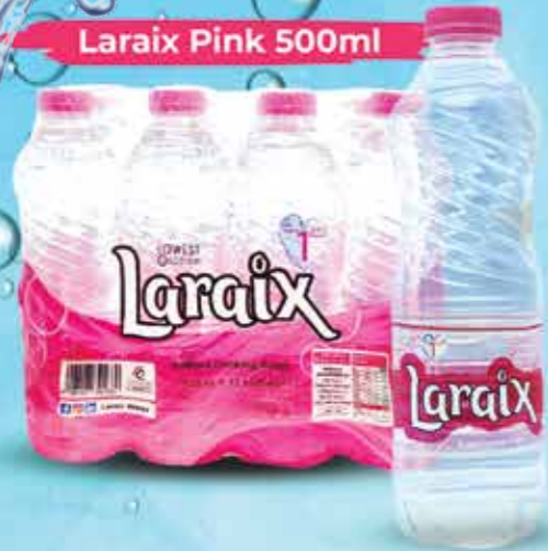
Laraix Pink 500ml