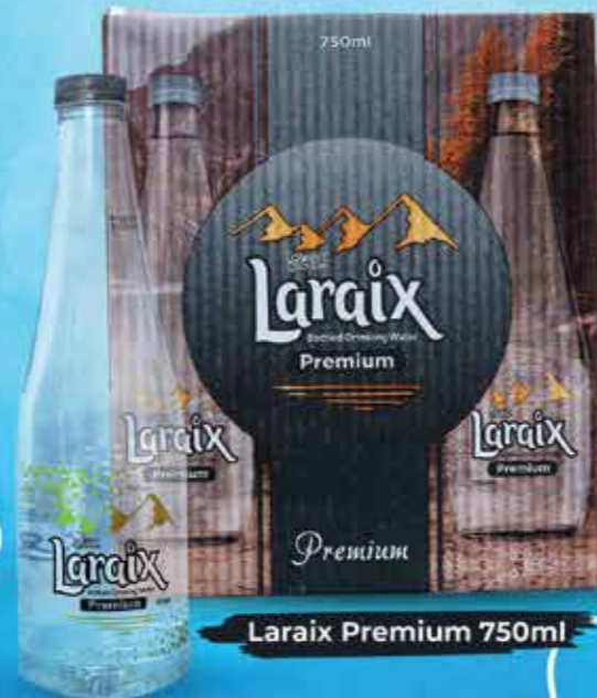
Laraix Premium 750ml