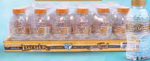
Laraix Gold 200ml