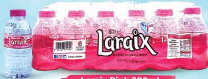
Laraix Pink 200ml